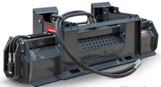
RR84 Model Shown

Equipped with the same aggressive rotor as our RotoRake, the Power Spur is more than a power rake. The carbide tips are designed to pass closely to the AR400 ledger, providing mulching, pulverizing, and shredding performance.