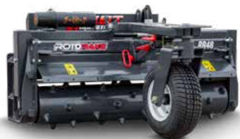
RR48 Model Shown