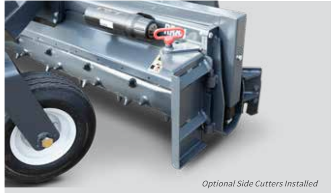
Optional Side Cutters Installed

The teeth are made from tough tungsten carbide and are welded to the rotor. To improve their pulverizing ability, the teeth are pointed and hold their edge for years.