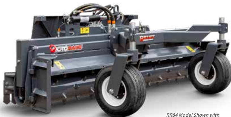
RR84 Model Shown with Hydraulic Angle & Tilt Option

Standard oscillating gauge wheels allow the rotor to work a consistent depth while traveling over rough ground and is equipped with a mechanical lockout to fix the rotor and gauge wheels to a level position.