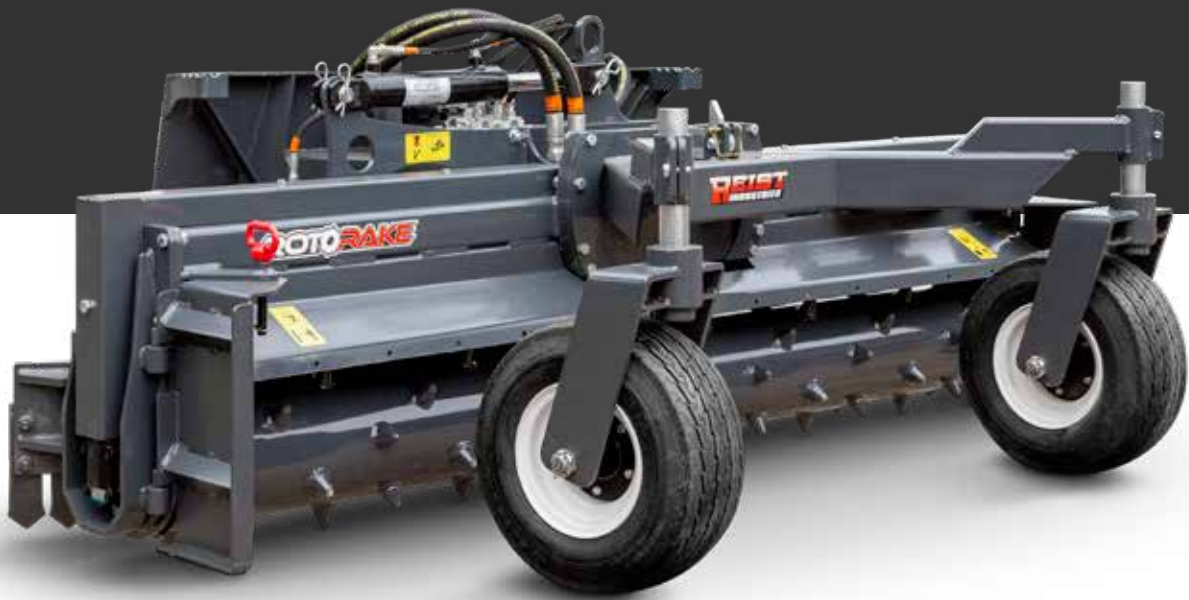
Shown with Hydraulic Angle & Tilt Option