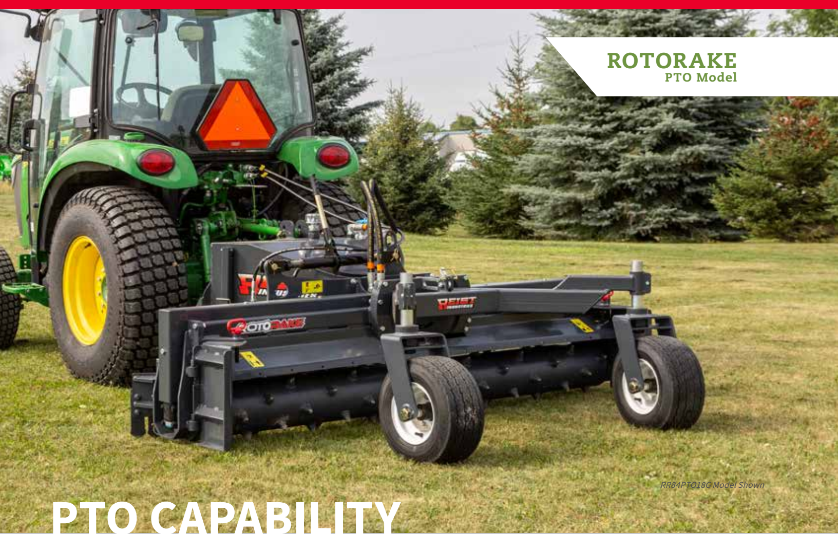
RR84PTO18G Model Shown