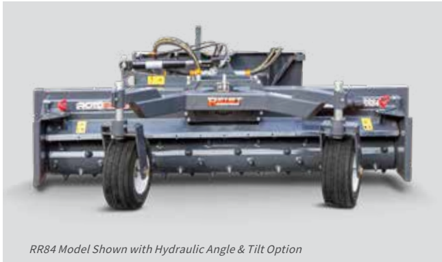
RR84 Model Shown with Hydraulic Angle & Tilt Option

The RotoRake's 10" diameter hydraulic bi-directional rotor allows for operation in both directions, making it easier to clear your land reducing the time needed to start your next pass.