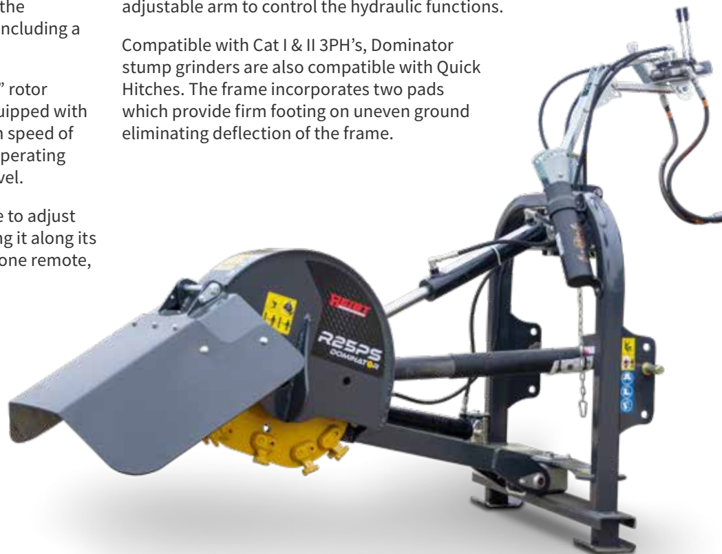
Model R25PSV (Shown in raised position)

Compatible with Cat I & II 3PH's, Dominator stump grinders are also compatible with Quick Hitches. The frame incorporates two pads which provide firm footing on uneven ground eliminating deflection of the frame.