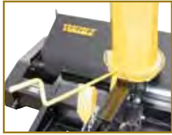
Manual Hood Turner