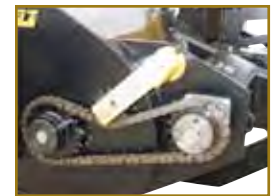
Self Adjusting Rubber Torsion Chain Tensioner