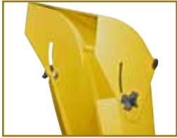
Manual Hood Deflector

20% LESS HORSE POWER REQUIRED TO OPERATE THAN CONVENTIONAL SNOWBLOWERS