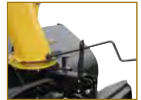
Manual Hood Turner