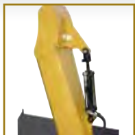
Hydraulic Hood Deflector