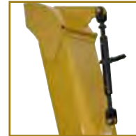
Manual Hood Deflector