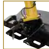
CAT I Hitch