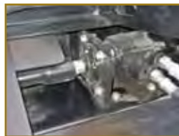
Hydraulic Drive Motor